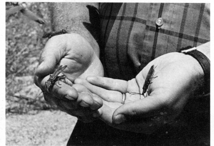
The giant Big Hole "salmon" flies, actually stoneflies, can be nearly three inches long, and can be picked off your shirt during a hatch and used live as bait if angler wishes (although the author does not admit to such low practices).

I know of no surer time or place for the moderately experienced fly fisherman, or even the novice, to tangle with a trophy trout on a fly in a stream. The fast-water ride for big trout beneath steep canyon walls and along cottonwood-lined meadows with a rugged mountain backdrop draws anglers from around the country to the Big Hole in the southwest